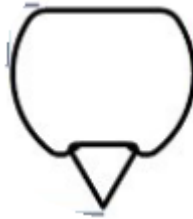
Round Bar (Trail) Carbide